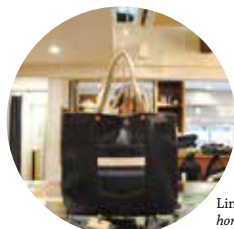
Limited edition, honten -exclusive tote bag (¥5,280)

Accessible and delicious authentic yoshoku cuisine