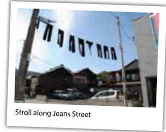
Stroll along Jeans Street

☎086-472-2001 (Nozaki Family Residence Salt Industry Historical Museum)