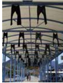
Walk under the hanging jeans to enter Jeans Street