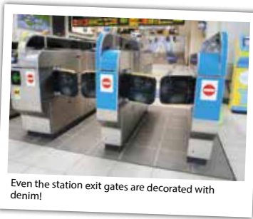
Even the station exit gates are decorated with denim!