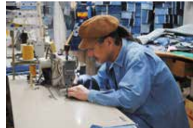
You can watch veteran artisans stitching products in-store