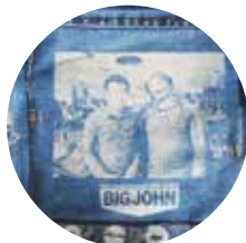
Favorite images can be added to denim fabric through laser irradiation processing