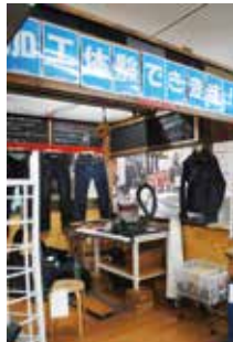
Have a go at dying denim with a denim artisan with over 15 years of experience