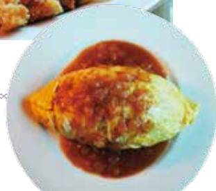
Rice-filled omelette, ¥650