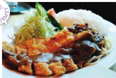
Lunch special, ¥700